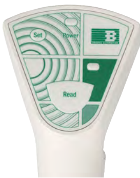
HF40 THR keypad