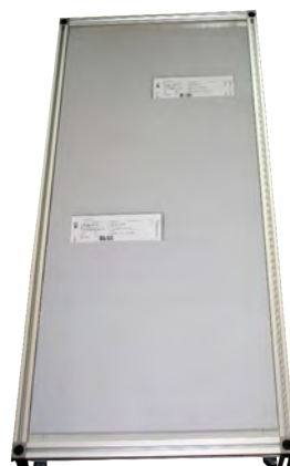
UHF kanban board