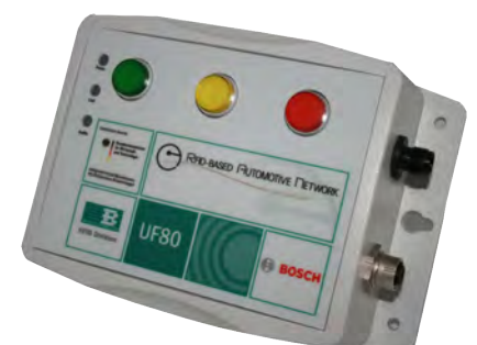
UF80 stationary reader