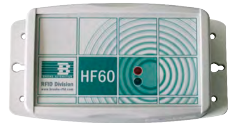
HF60 IAE stationary reader